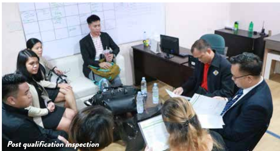
Post qualification inspection

Upon intensive examination, the committee awarded the bid for the elevator construction project to ELECOL Engineering Equipment Supply and Services and the 43rd ANC Bag to Bihis Cruz, Inc. Winning bids were bidders that passed as the lowest calculated responsive bid.