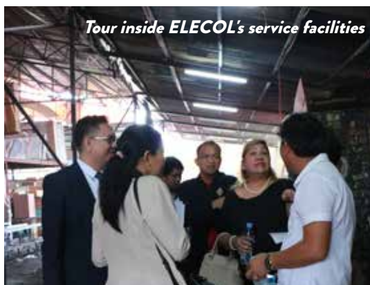
Tour inside ELECOL's service facilities