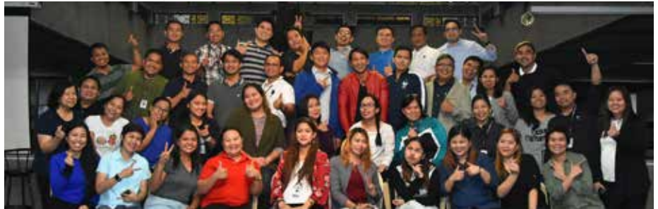
Group Photo of the UP-ISSI 116th Manager's Course attendees